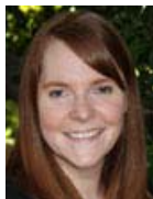
Amy Roebuck California Department of Justice, Office of the Attorney General